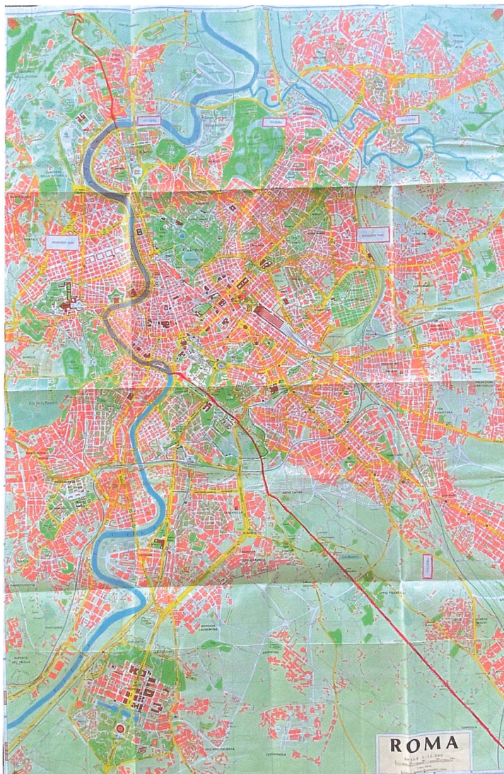
19860220, Rome Italy Stake Application, Rome Unit Boundaries