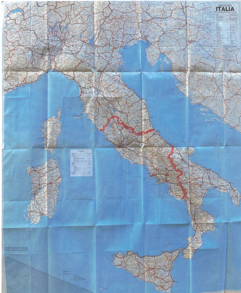
19860220, Rome Italy Stake Application, Stake Boundaries